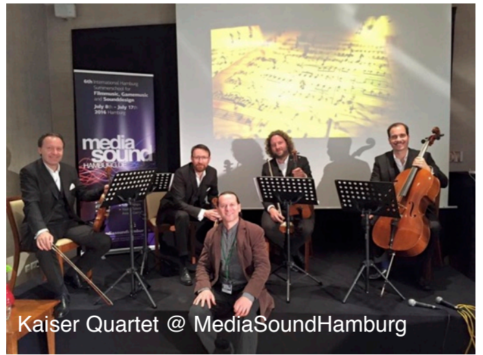
Kaiser Quartet @ MediaSoundHamburg

Of all Chandler's novels, Playback is the only one never has been adapted into a film.